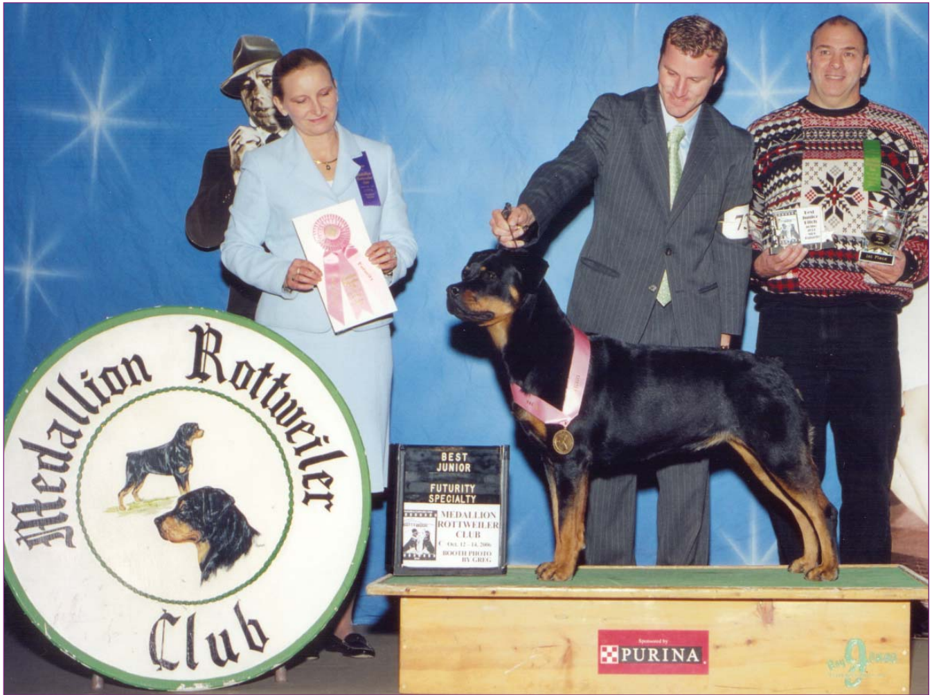
15 Months - Best Senior Puppy in Futurity - Medallion Rottweiler Club specialty