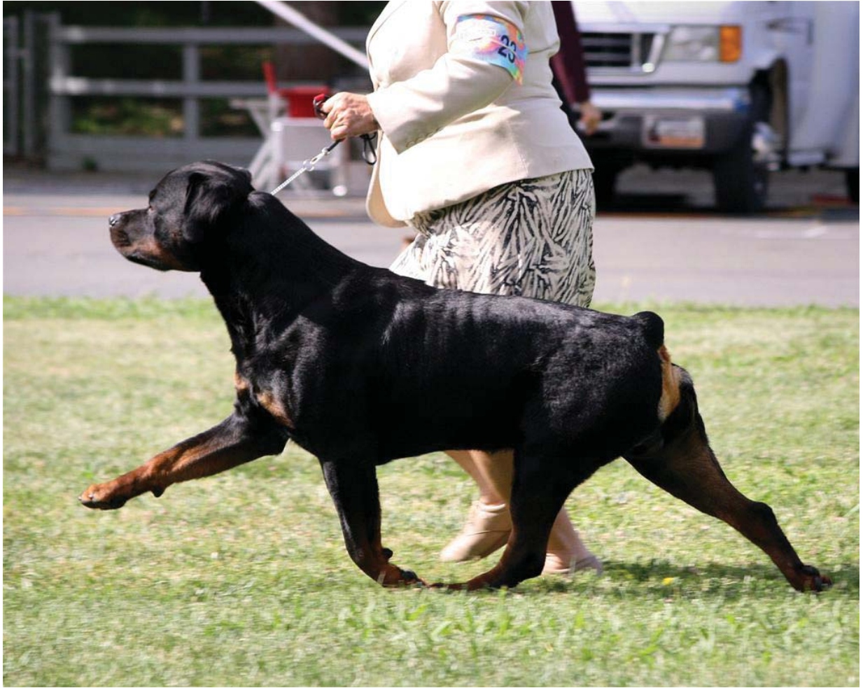
Multi BISS Ch. Chancellor's Gorgeous Patrone, TT, Multi AOM