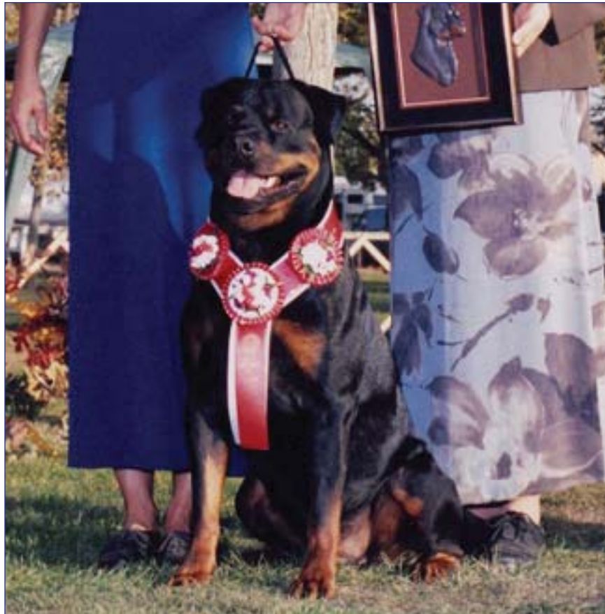
Ch. Chancellor's Echo Of Fame (Dam of Patrone)

BOSS Select Ch. Baar's Devil'N Disgiz v Blackrock SELECT - 2003 ARC National BOSS - 2003 ARF Specialty 2004 Top Twenty Multi-Best of Breed winner (Sire of Patrone)